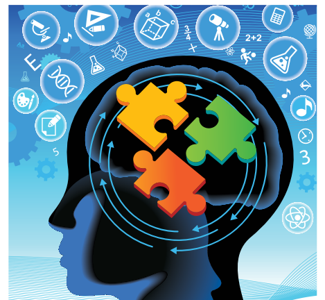
Core Content and Beyond