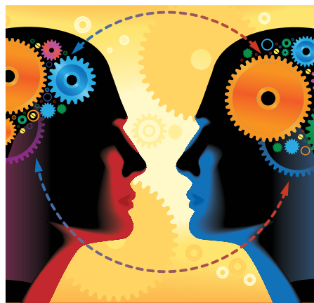
Teacher and Principal Voices