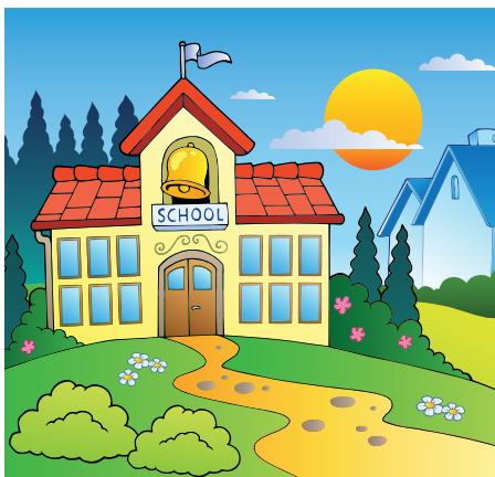
Major Sites For News & Information

The Essential, the Helpful & the Just Plain Fun