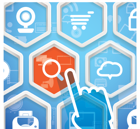
Other Cool Websites